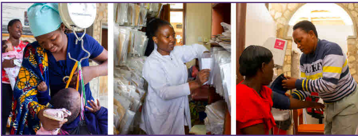
Every spare space at the medical center has been modified for patient care, and the need for efficiencies like electronic medical records has become more pressing.

D odoma Christian Medical Center (DCMC) has seen explosive growth in the number of patients needing medical services over the past few years. The hospital's financials have been stretched in the process, but it's the lack of space to care for so many patients – nearly 100,000 in 2018 – that has been placing a chokehold on DCMC's ability to grow its services and maintain quality care.