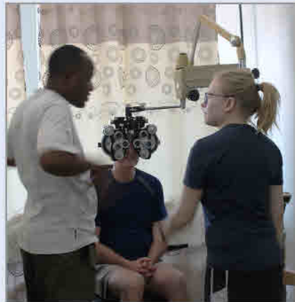
Eye clinic volunteers setting up and checking the equipment at the new DCMC eye clinic.