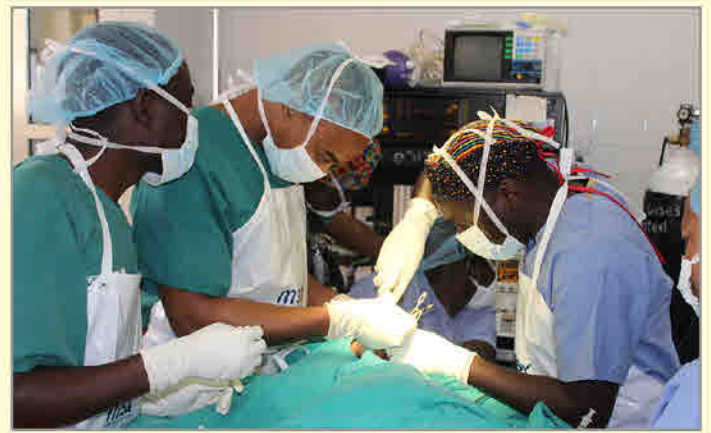
The hospital is seeing more complex patient cases, and its surgery center is busier than ever. As a referral site for high-risk pregnancies, in particular, DCMC nurses are obtaining specialized skills in neonatology and critical emergency care.

L acking the physical space to care for more patients, DCMC is expanding its reach to provide quality health care to the broader region. From grant-funded outreach to rural communities, to daily responses to patients referred from other facilities, DCMC is doing everything it can to help meet the region’s medical and dental needs.