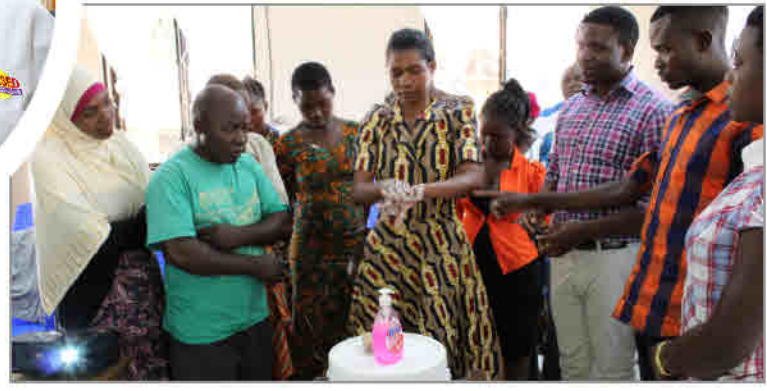
Village health workers from the Dodoma region learn proper handwashing from DCMC's Community Health outreach team, which has been holding seminars on hygiene and sanitation, women's health, emergency obstetrics skills, and more to help improve health in rural areas.